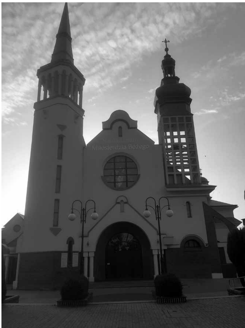
Santuarium at Świebodzin, Poland (author)